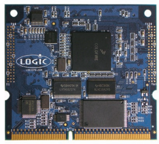
FREESCALE MCF5373 FIRE ENGINE

The MCF5373 Fire Engine is ideal for applications in the medical, point-of-sale, industrial, and security markets. From patient