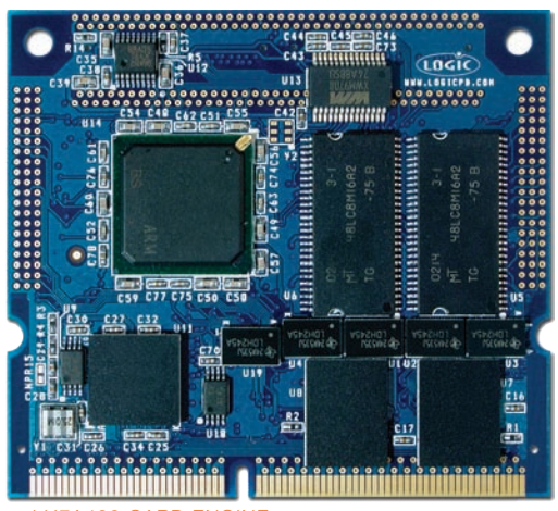
LH7A400 CARD ENGINE

The LH7A400 Card Engine is ideal for applications in the medical, point-of-sale, industrial, and security markets. From patient