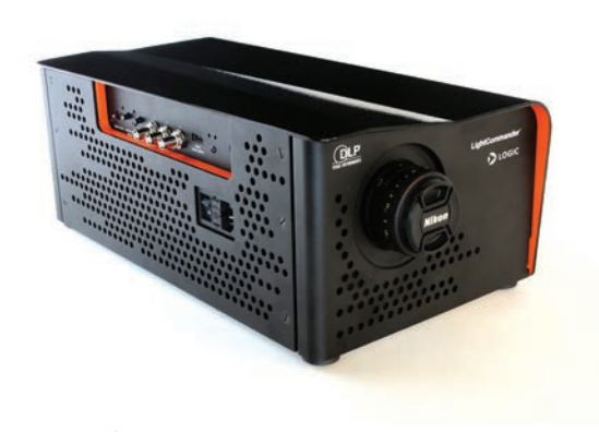
DLP LightCommander Development Kit

The DLP LightCommander takes DLP development to a new level. The fully self-contained kit benefits developers looking to