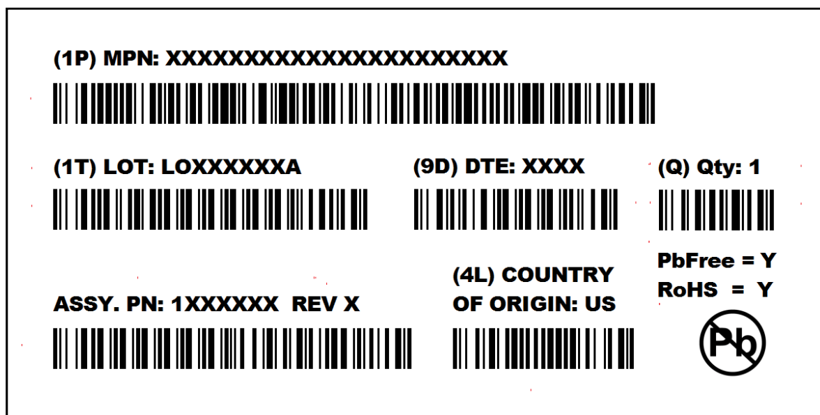
Figure 2-1. Outer Barcode Label Applied to ESD Bag Packaging

All Logic PD SOM assemblies are packaged in a protective ESD bag that has an attached outer barcode label as shown in Figure 2-1 below. In the specific case of Torpedo SOMs, a tray of up to 50 SOMs are contained in a single large ESD bag that also includes this outer barcode label.